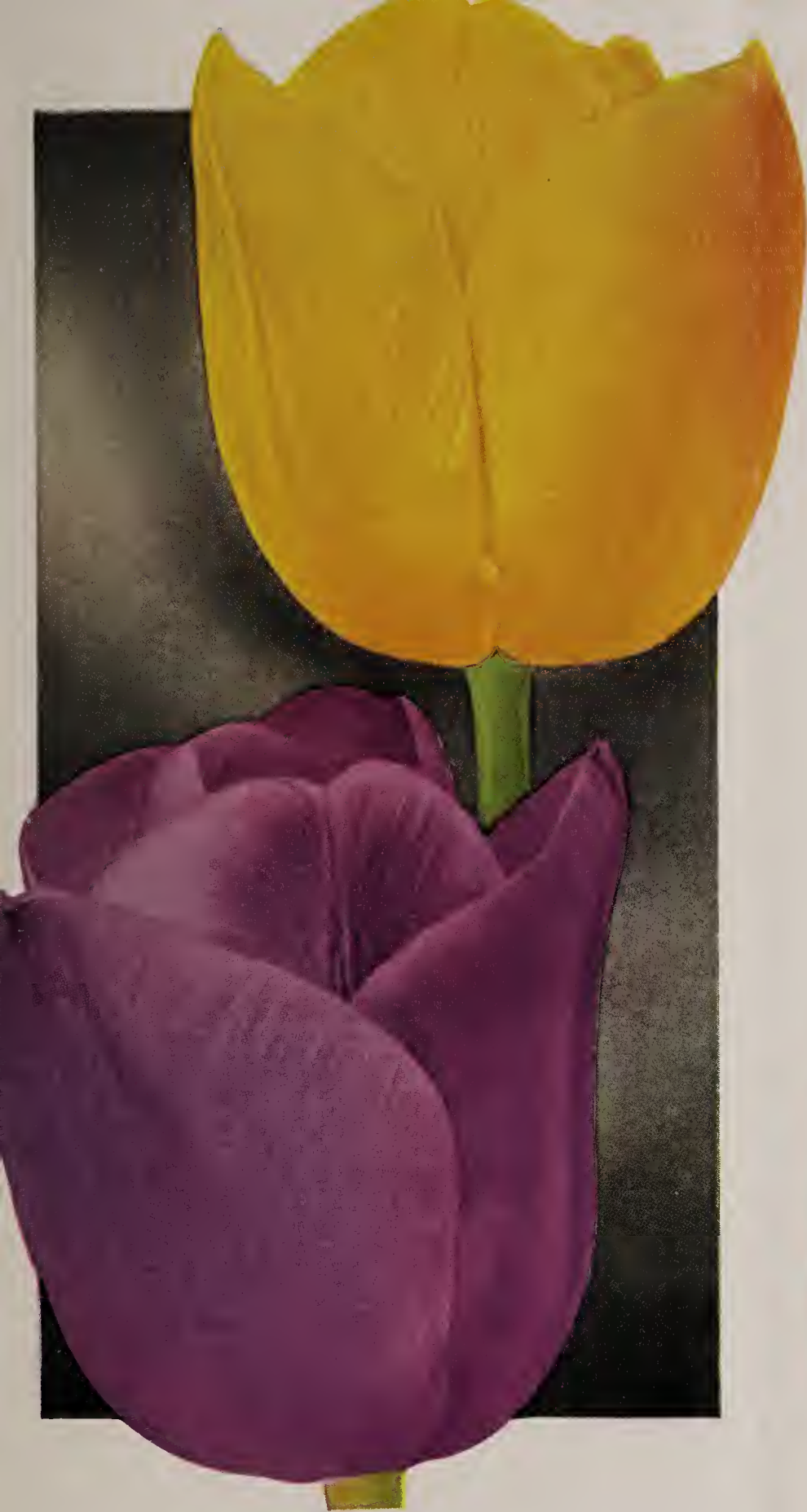
Top—Darwin Yellow Giant Lower—Darwin Scotch Lassie